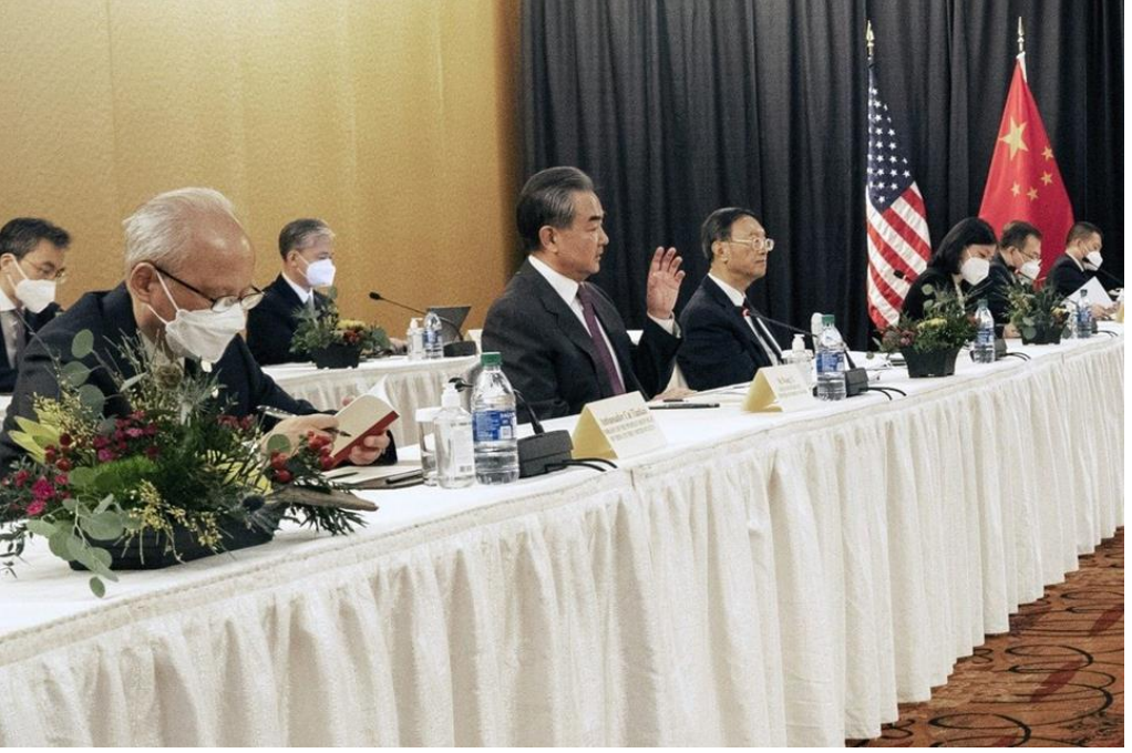
Chinese state councillor and Foreign Minister Wang Yi puts forward China's position at the start of the high-level talks with the United States in the Alaskan city of Anchorage on March 18, 2021.

While the temperature was freezing in Anchorage, the exchange between Chinese and American top diplomats became heated during