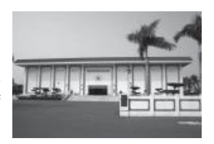
The Republic of China Air Force Museum in Kaohsiung.

The large room with blue walls boasts sections with