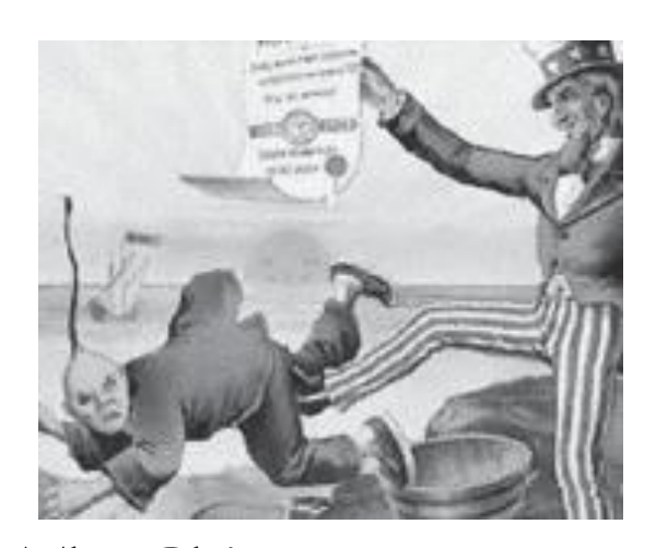
The Chinese Exclusion Act: Ten Year Exclusion Act Debates and Passage —Part 3