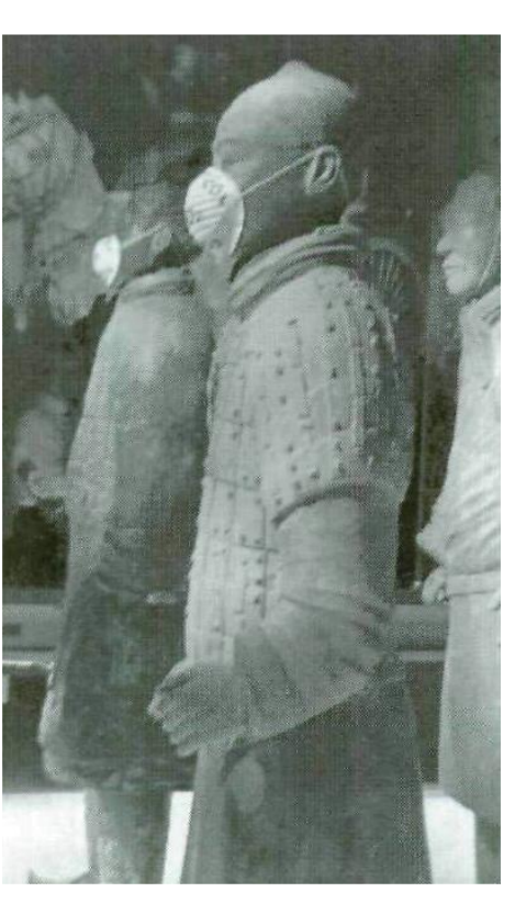
...China's rapid economic development does come at a price and the most serious would be the environmental cost.

developed economies in the exploiting valuable economic opportunities, creating green collar jobs and leading development of critical low carbon technologies." The report goes on to say that China has the advantage of low cost, a clear policy framework, a dynamic and entrepreneurial