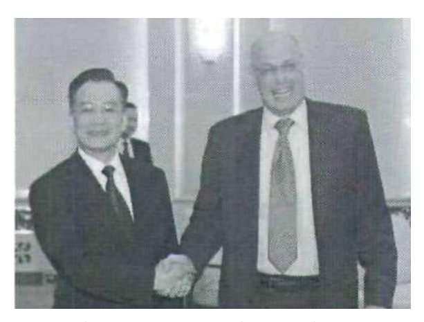
Chinese Premier Wen Jiaba met with U.S. Treasury Secretary Henry M, Paulson.

nations and economies in the world, a strong positive bilateral relationship is important not only to the peoples of the two countries but to a peaceful world.