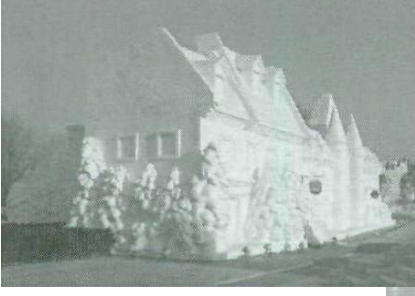
The Harbin Ice Festival, is from January 5 and lasts for over one month. Harbin is the capital city of Heilongjiang Province and this is China's original and greatest ice artwork festival, attracting hundreds of thousands of local people and visitors from all over the world.