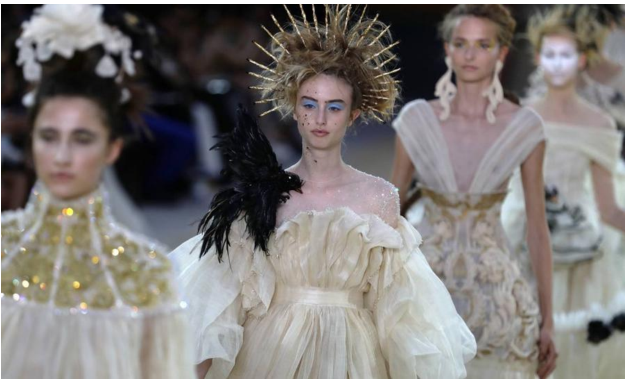
Guo Pei's haute couture collection in Paris on July 3, 2019.