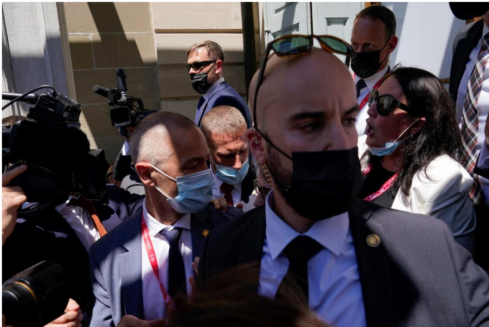
Security personnel corral members of the press covering President Biden's meeting with Russian President Vladimir Putin on Wednesday in Geneva.

Still, Putin described Biden as experienced and balanced. "We have to represent our countries and the relationship is a pragmatic one, primarily," Putin said.