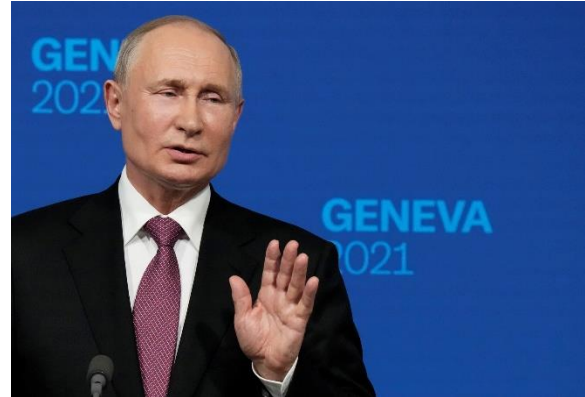
Russian President Vladimir Putin speaks during a news conference after his meeting with President Biden in Geneva on Wednesday

Before Biden's press conference, Putin addressed reporters, many from state-owned Russian media. He said the conversations were constructive. "I think there was no hostility, quite the contrary," said Putin.