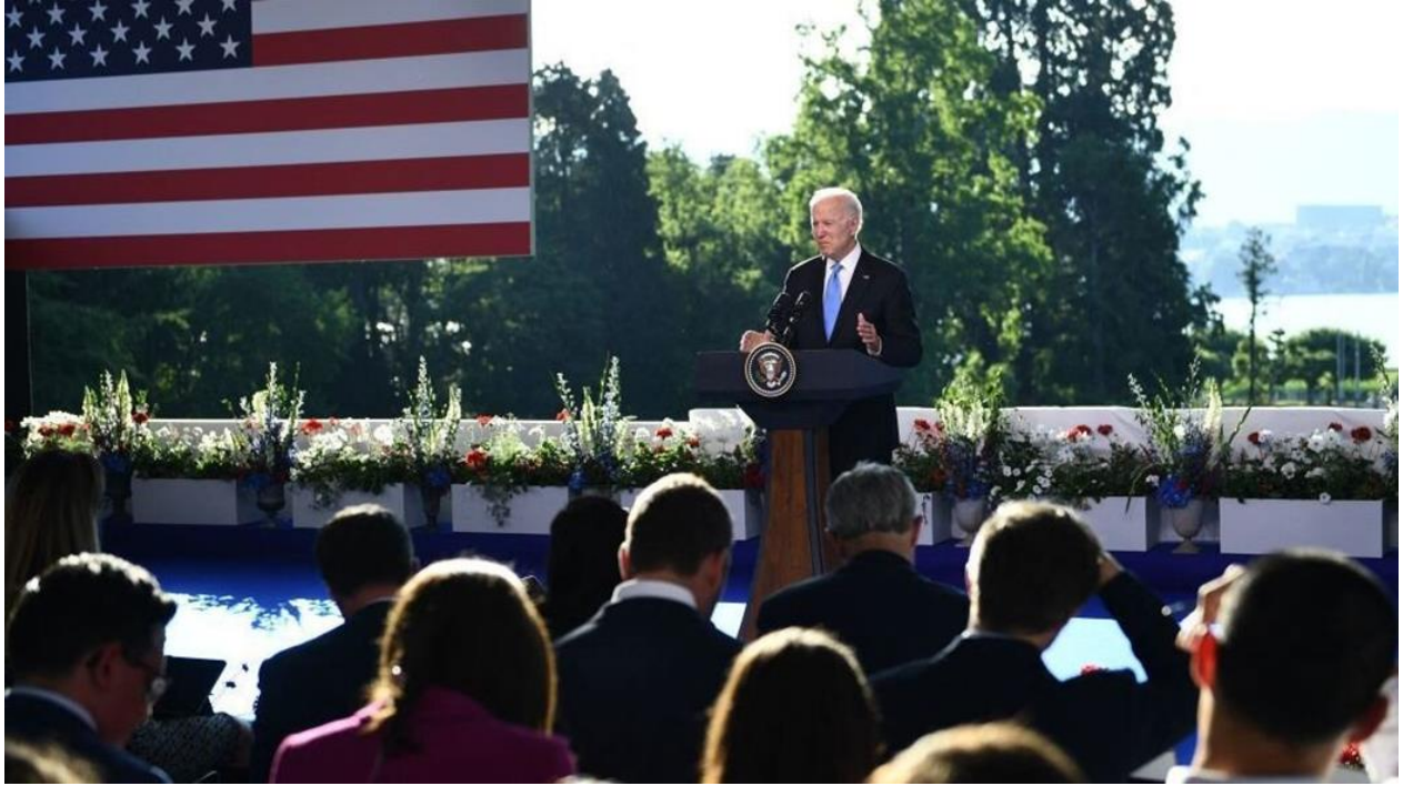
President Biden holds a press conference after the U.S.-Russia summit in Geneva on Wednesday.