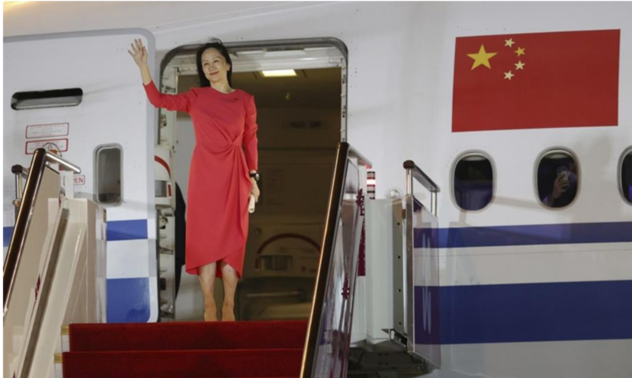
Meng Wanzhou waves to a cheering crowd as she steps out of a charter plane at Shenzhen Bao'an International Airport in Shenzhen, south China's Guangdong Province, Sept. 25, 2021.

https://www.globaltimes.cn/page/202109/1235077.shtml