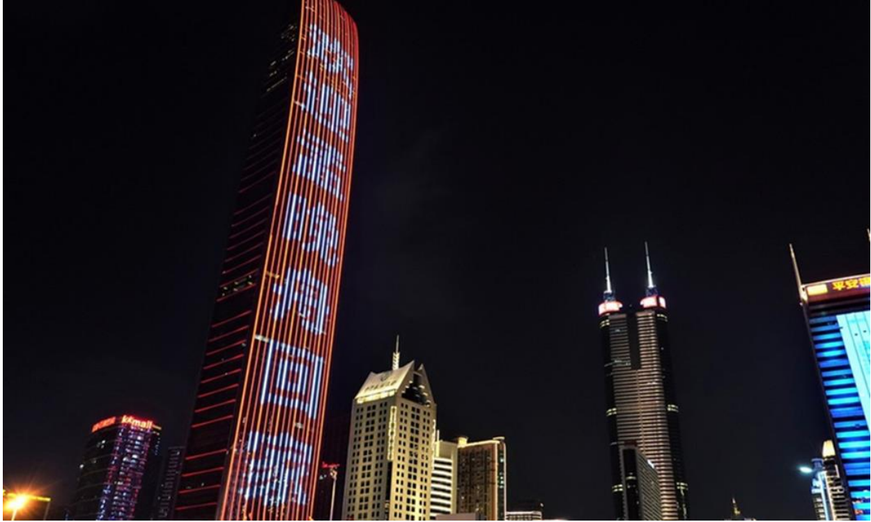
Landmark buildings in Shenzhen exhibit giant slogans welcoming Meng's return.

"What the United States and Canada have done is a typical case of arbitrary detention."