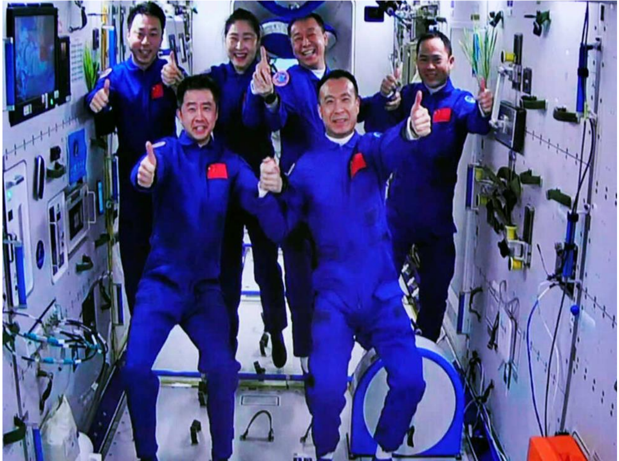
In this photo released by Xinhua News Agency, the Shenzhou-15 and Shenzhou-14 crew take a group picture after a historic gathering in space on Nov. 30. Guo Zhongzhen/AP

time. The station's third and final module docked with the station this month.