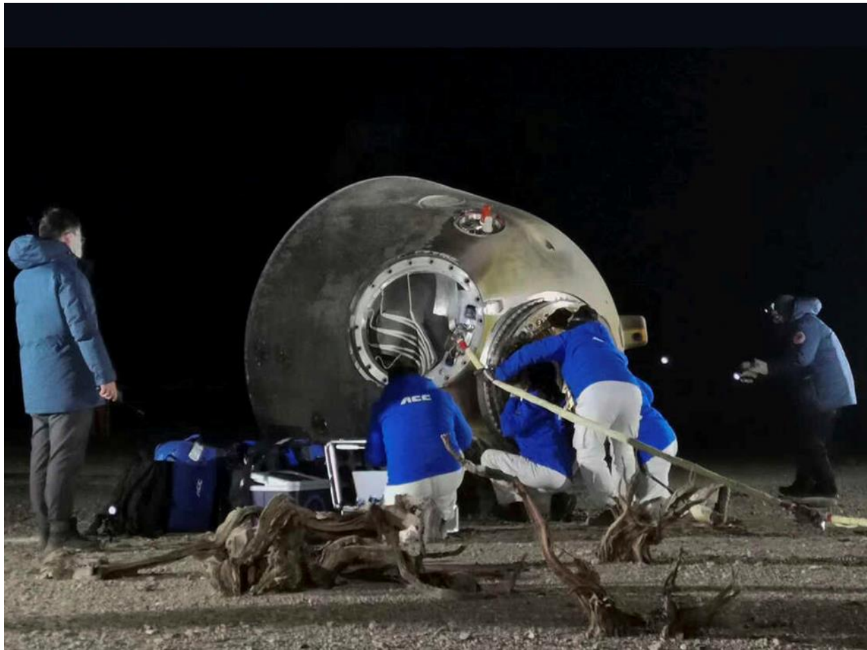
Ground crew check on the astronauts inside the re-entry capsule of the Shenzhou-14 manned space mission after it lands successfully at the Dongfeng landing site in northern China's Inner Mongolia Autonomous Region on Dec.4.

https://www.npr.org/2022/12/04/1140637573/china-astronauts-tiangong-space-station