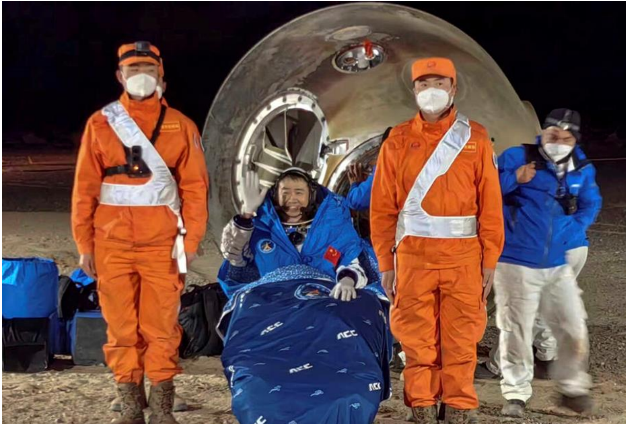
Astronaut Chen Dong waves as he sits outside the re-entry capsule of the Shenzhou-14 manned space mission after it lands successfully at the Dongfeng landing site.

China built its own station after it was excluded from the International Space Station, largely due to U.S. objections over the Chinese space programs' close ties to the People's