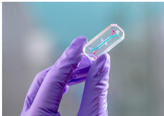
Researchers will place cells from each Artemis II astronaut onto an ‘organ on a chip’ to test their reaction to deep-space radiation during the flight.

These biological experiments will run throughout the course of the Artemis II flight. Other research, however, will be limited to the six high-adrenaline hours during which the