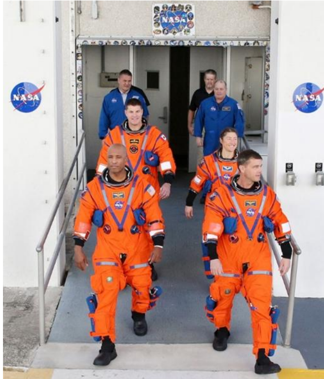
The four Artemis II astronauts did a dress rehearsal in December for what will happen on launch day. Clockwise from front left are pilot Victor Glover, mission specialist Jeremy Hansen, mission specialist Christina Koch and commander Reid Wiseman.

Some of the key experiments that will be conducted during the Artemis II mission will explore how deep-space travel affects human health. Other research will rely on the astronauts' ability to see geological features on parts of the Moon that have never been viewed by human eyes.