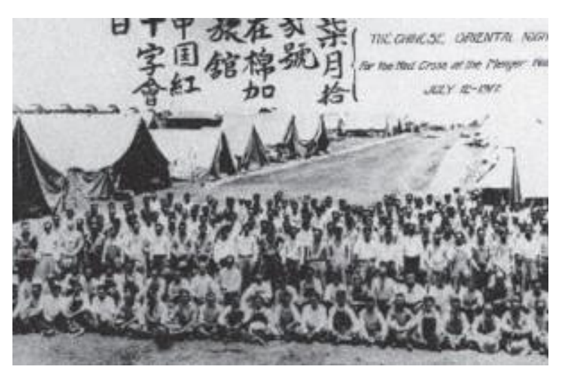
"Pershing's Chinese" in San Antonio, July 1917— The occasion is the Chinese Oriental Night for the American Red Cross.

Pershing led a force of 6,675 men that penetrated about 400 miles into Mexico. They defeated Villa's revolutionaries in several skirmishes but failed to capture their leader. Villa eventually negotiated an amnesty with the Mexican authorities in 1920 but was assassinated in 1923, probably with the support and collusion