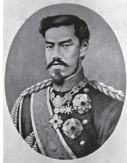
Japan's Emperor Meiji (1852-1912) modernized the Imperial army, but many officers were recruited from Samurai warriors who pledged absolute loyalty to the Emperor to carry out his ambition to conquer Asia. The Emperor was worshipped by all Japanese to r

Japan's Emperor Meiji (1852-1912) modernized the Imperial army, but many officers were recruited from Samurai warriors who pledged absolute loyalty to the Emperor to carry out his ambition to conquer Asia. The Emperor was worshipped by all Japanese to reach to a status of god. This was the culture behind Japanese aggressions and atrocities. Even though Japan is now supposedly a democracy, power is controlled in the hands of a few families. They convince the people to be loyal to the government in the quest to regain past glory. It's a case of the wolf leading the sheep. To this day, they do not admit their war crimes. Most Japanese people do not know about the war history. History textbooks were changed to whitewash their war activities. Japan portrays itself as a victim of WWII, being the only country to suffer from atomic bombing, rather than the perpetrator of war crimes. Right-wingers tried to justify the practice of "sex slaves" in WWII and to declare that there were no war crimes.