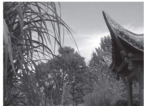
Song Mei August 2010

center and a banquet hall with special event seating for up to 200 people. The 85-foot Floating Clouds Pavilion will soar over the Garden, placed on an axis with the Space Needle. As a major destination and cultural institution, the Seattle Chinese Garden will inspire new perspectives on world affairs and illuminate China and her cultural and economic influence on the Pacific Northwest. From ancient times Chinese city planning has been characterized by symmetry and control. Chinese gardens, meanwhile, appear natural and unregulated. Whereas cities were Confucian, gardens were liberated and Daoist: one promoted social order and hierarchy, while the other encouraged personal fulfillment. The garden was understood as a microcosm, a