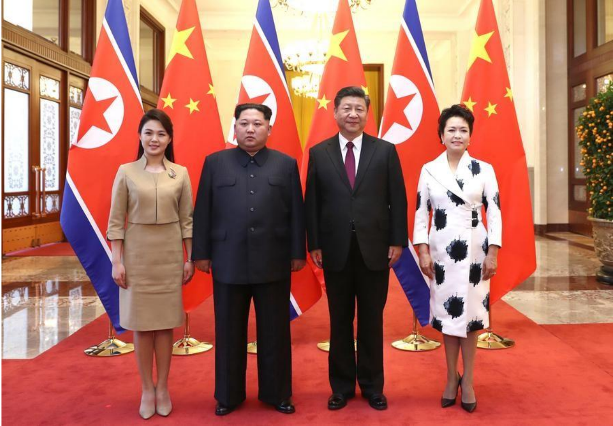
At the invitation of Xi Jinping, general secretary of the Central Committee of the Communist Party of China (CPC) and Chinese president, Kim Jong-un, chairman of the Workers' Party of Korea (WPK) and chairman of the State Affairs Commission of the Democratic People's Republic of Korea (DPRK), paid an unofficial visit to China from March 25 to 28. During the visit, Xi held talks with Kim at the Great Hall of the People in Beijing. Xi held a welcoming ceremony for Kim before their talks.

The DPRK is willing to have dialogue with the United States and hold a summit of the two countries, he said.