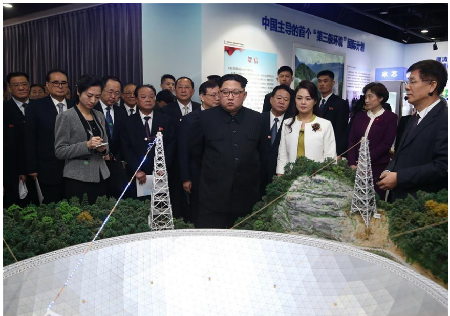
Kim Jong-un visits an exhibition showcasing the innovation achievements of the Chinese Academy of Sciences since the 18th National Congress of the Communist Party of China (CPC).

Kim said that the DPRK-China friendship is especially precious, adding he would like to join hands with Xi to follow the noble will of leaders of the elder generations, carry on and develop the DPRK-China friendship that remains unchanged despite winds and rains,