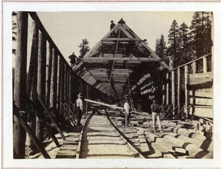
246. Constructing Snow Cover. Scene near the Summit.