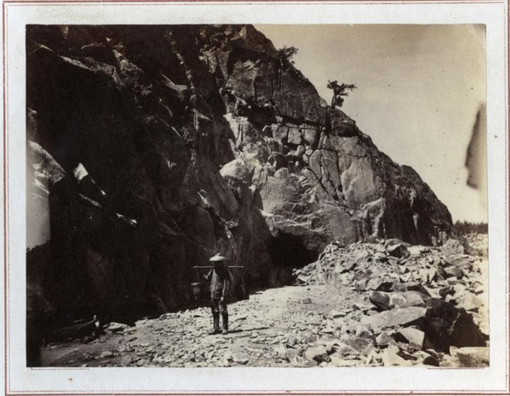
204. Heading of East Portal, Tunnel No. 8, from Donner Lake Railroad, Western Summit.