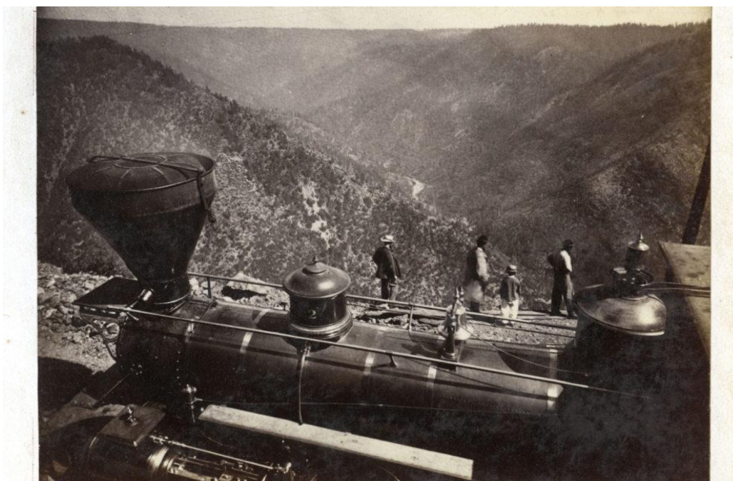
View of the Forks of the American River, three miles above Alta.